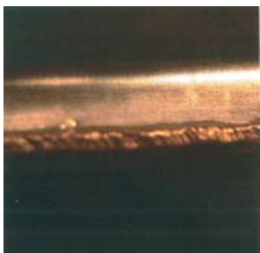
MIG brazing is used on a large scale for the construction of car bodies and other transport vehicles in galvanized high tensile steel to maintain strength properties in the steel and to protect the anti-rust zink coating.

The key word is maintainance of strength and corrosion properties in the welded joint. The fusion point temperature is low ( below 1000 C) In this gentle welding process, the stucture of the steel is not compromised.